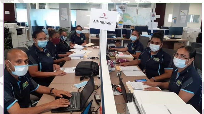
The Air Niugini Travel Desk Team at the National Control Centre located at level 4 Morauta Haus. The team responds to over 100 applications per day for passengers intending to travel into the country.

The team consists of staff from various sections under the Commercial Services Department. They have been in operation since May 2020.