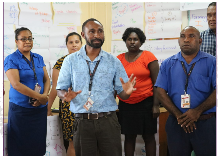
Staff during the annual management skills training

They also give general legal advice and litigation matters on behalf of Air Niugini.