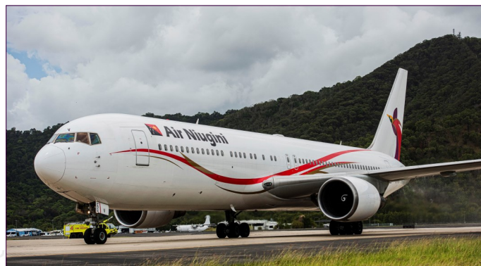
Air Niugini continues to operate with strict health and safety measures in place including temperature testing of all passengers, and providing face masks and hand sanitizer to ensure the safety of travellers.

It is likely there are other service providers in PNG that are also able to do these PCR tests for passengers.