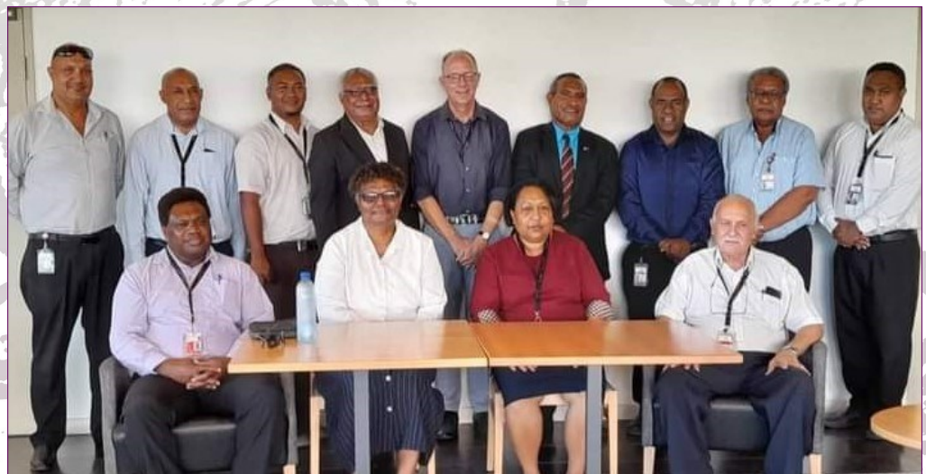
Air Niugini Management Team during the dedication ceremony at the flight deck.