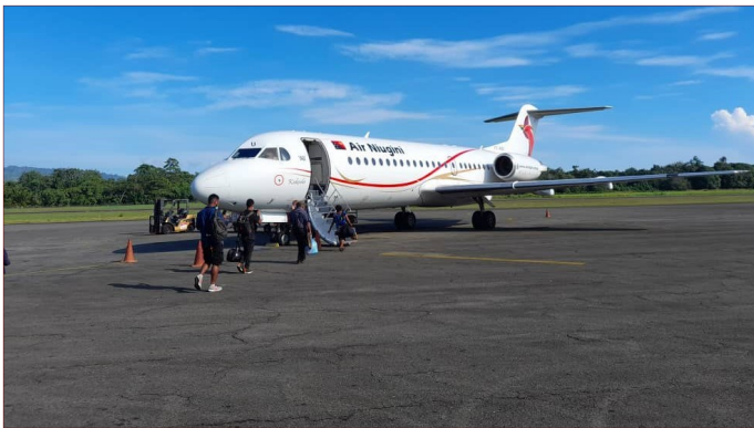
Passengers boarding a flight at Madang Airport

Air Niugini has earlier on advised the travelling public of the temporary shortening of the runway lengths at Madang and Wewak airports by the National Airports